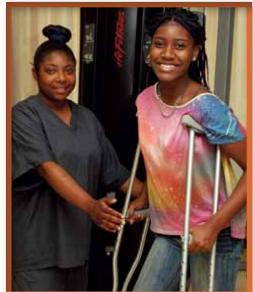
PHYSICAL THERAPY AIDE

Or go to: www.wilsontech.org • www.mytechnow.org