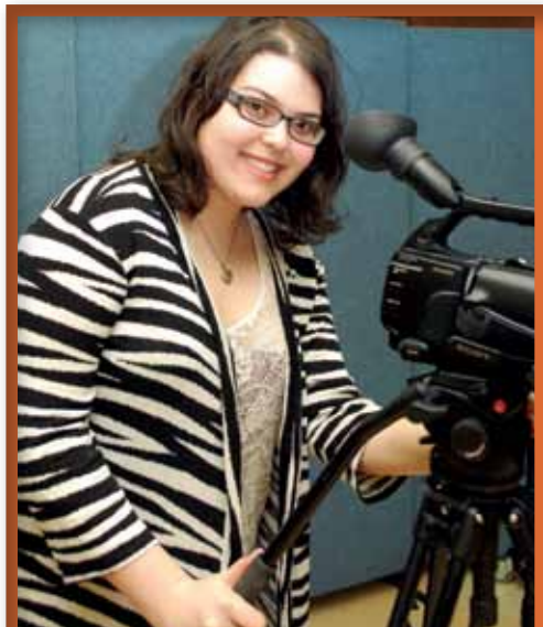
DIGITAL FILM & VIDEO PRODUCTION

Join the ever growing health care field as a medical laboratory assistant or a medical assistant. The skills you'll learn at Tech can also be applied to other careers in health. All of the most recent Tech graduates are either employed or continuing their education in the health professions.