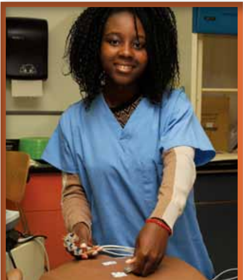
MEDICAL LABORATORY/ MEDICAL ASSISTING